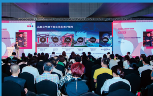
Shanghai International Shopping Mall Development Forum