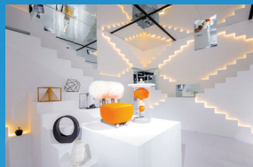
Hotel Plus Mockup Room Show