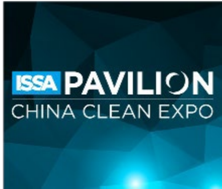
Shanghai, China March 29 - April 1, 2022