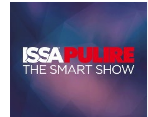
Milan, Italy May 9 - 11, 2023