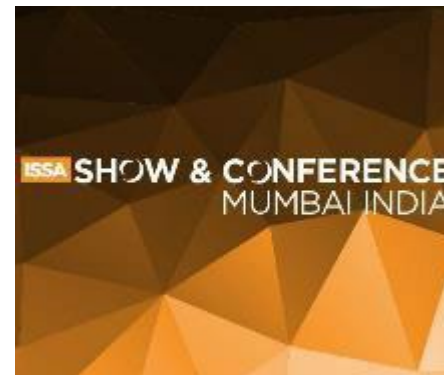
Mumbai, India November 3 - 4, 2022