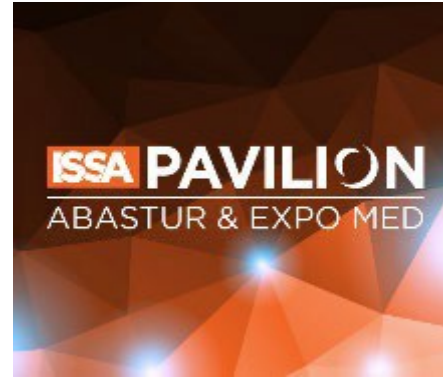
Mexico City, Mexico August 31- September 2, 2022