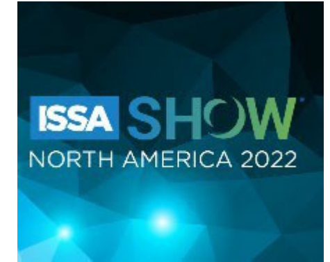
Chicago, Illinois October 10 - 13, 2022