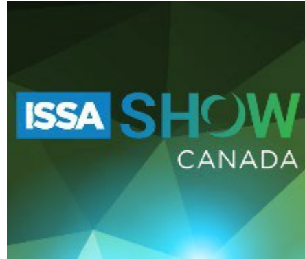
Toronto, Canada June 8 - June 9, 2022