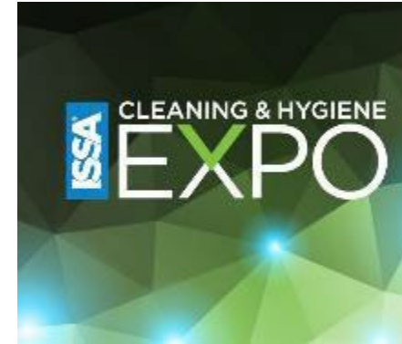
Sydney, Australia September 14 - 15, 2022