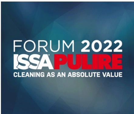
Milan, Italy October 18-19, 2022