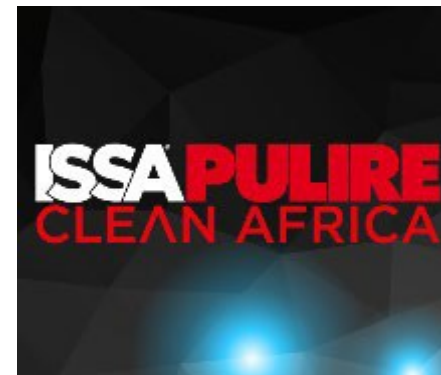
Lagos, Nigeria November 16 - 18, 2022