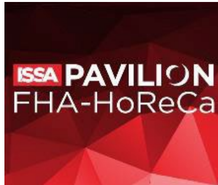
Singapore October 25 - 28, 2022